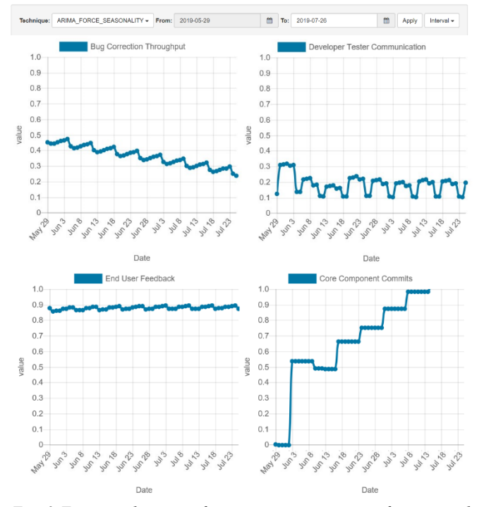
Fig. 3 Forecasted means of project metrics using qr-forecast and seasonal models